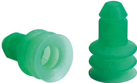
Bellows Suction Cups SPB2 P (2.5 Folds)